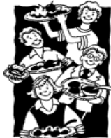
Family Night Supper

Save the date of Thursday, October 13, 6:00 pm in the Fellowship Hall and join us for a delicious home-cooked meal. Come along and enjoy great friendship and fun. Bring a friend too. The cost is $7/adult and $4/child up to age 12. Sign up in the Narthex or call the church office at 732-3435 by noon on Tuesday, October 11.